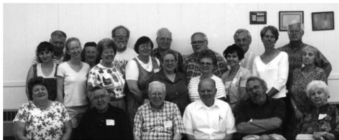
Saturday Banquet Attendees