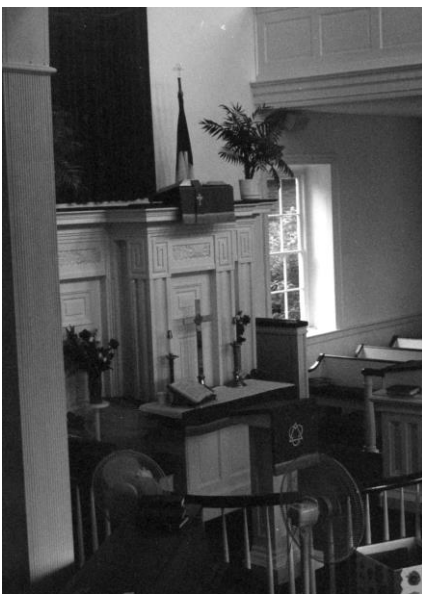
Brush Creek Church Interior